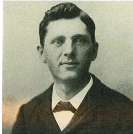
Leon Czolgosz in a 1901 portrait.

Concerns about security continued to gain momentum with the assassination of President William McKinley by the anarchist Leon Czolgosz in September 1901. Soon, Congress passed the Anarchist Exclusion Act. It prohibited the immigration of anarchists—the first exclusion of immigrants based on political